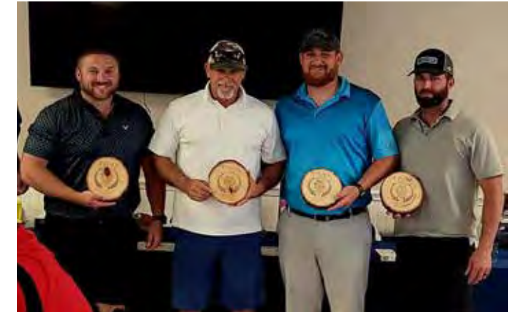
Chapter 15 hosted Inaugural Golf Tournament. Trophies and prizes were presented to 1st and 2nd Place winners.