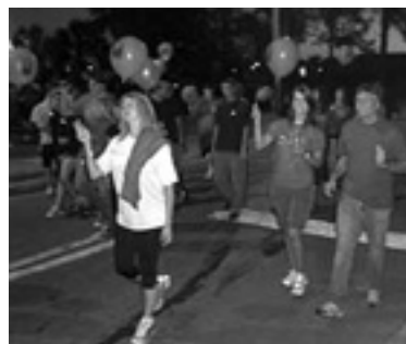
Chapter 30 members and Hernando C.I. staff participating in the "LLS - Light the Night Walk".